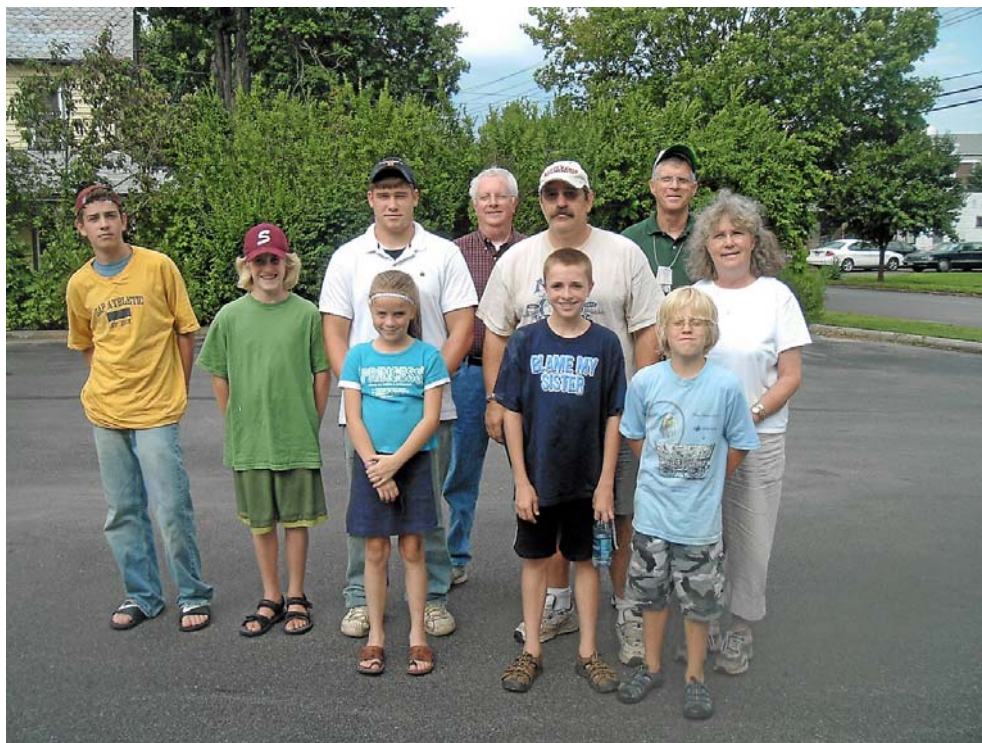
Shown in photo above are – from left to right – front row: